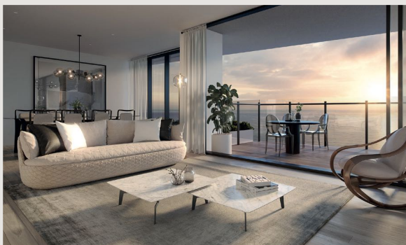
ARTIST IMPRESSION, INDICATIVE ONLY. TIMBER BALCONIES PROVIDED TO PENTHOUSE APARTMENTS ONLY, REFER TO INDIVIDUAL FLOOR PLANS FOR FINISHES.

The striking landscaped façades of the twin mid-rise apartment buildings at Magnoli Apartments creates the effect of a cascading urban garden. This intimate connection to the natural environment is further entwined through generous landscaped setbacks and the creation of a large community parkland. Private resident amenities include a resort-style pool, lounge, and landscaped gardens and entertaining areas. The six architectural homes, located within the precinct, also enjoy access to all exclusive resident amenities, including secure basement parking.