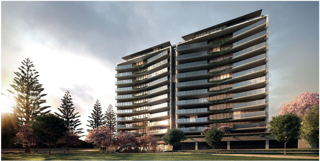
ARTIST IMPRESSION - INDICATIVE ONLY

Sunland Group is proud to present Magnoli Apartments – a collection of boutique residential apartments and architecturally designed terrace homes, only metres from the pristine coastline of Palm Beach.